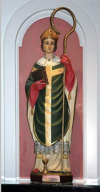
St. Richard of Chichester