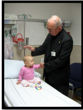
Saint Louis, MO, Saint Anthony Hospital