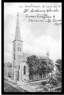
Saint Louis, MO, Saint Anthony of Padua Church, 1909