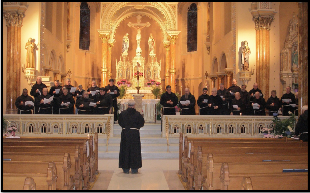
Franciscans Renewal of Vows, Saint Louis, MO, Saint Anthony of Padua Church