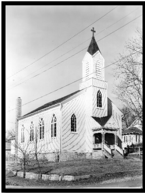
Eureka, MO, Sacred Heart Church