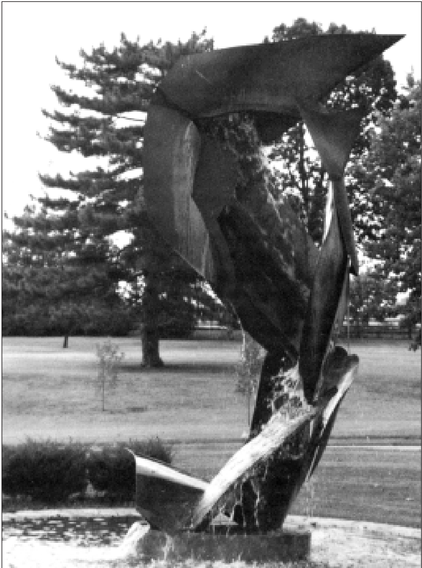
The Mercy of God flows through His Church to His people.